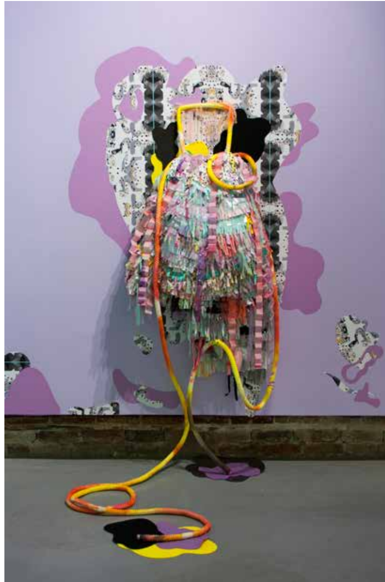
Divine Minnie , 2014 hand-dyed fabric polyfil, rope, found objects, and vinyl 69" x 26" x 10"