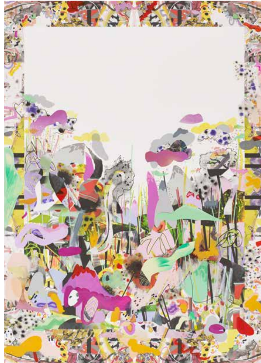
This Landscape, This Place , 2014 mixed media, collage, and inkjet print on paper 35" x 24"